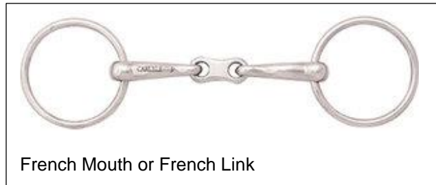
French Mouth or French Link