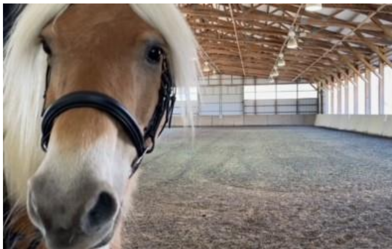
OUR INFAMOUS HALFLINGER PHOTOBOMBER SELFIE 🤪 🤪