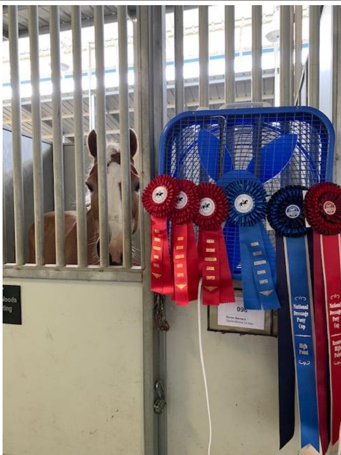
Ponied Up To The Pony (Tony) Awards

Santa Monica of Deer Haven made her second score in Second Level for their Bronze Metal this weekend. Also won Champion on Sat. and Reserve Champion on Sunday High Score for National Dressage Pony Cup.