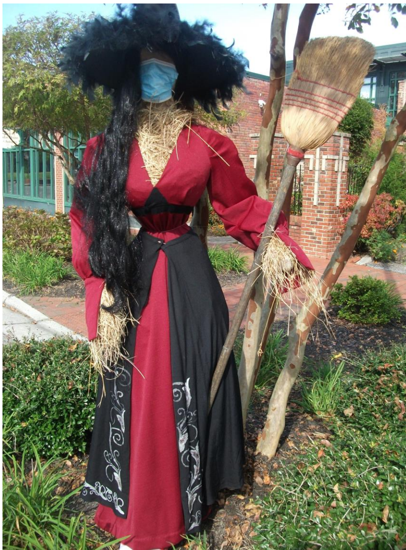
Witch of Smithfield