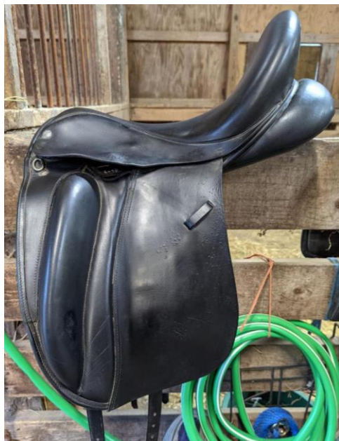
18" Custom Dressage saddle – Wolfgang medium wide.

30/01 05/08 Great American Insurance Group – Lexington, VA Pinehurst Fall Dressage – Pinehurst, NC? 14/15 CBLM - New Jersey Horse Park – Allentown, NJ 22/23 29 Wakefield Airfield – Wakefield, VA 30 SVDA Schooling Championship Show