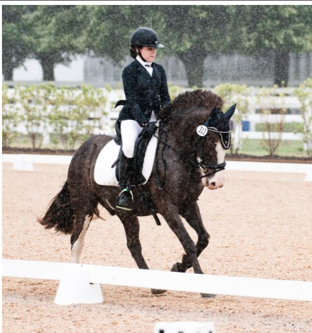
That's rain, not snow, this was Sunday's weather.