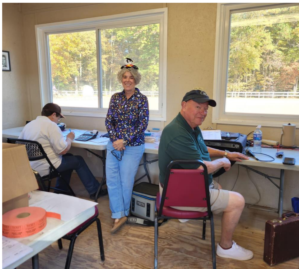
Behind the scene, what goes on in the clubhouse stays in the clubhouse