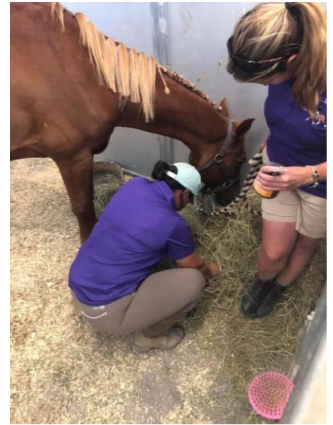
Needle in a Haystack