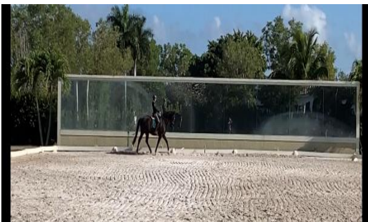
Leggy and I doing fancy trot!