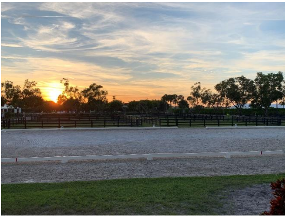
Sunset in Wellington