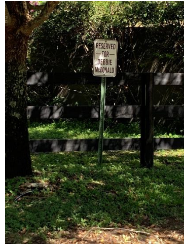
Yes I took a