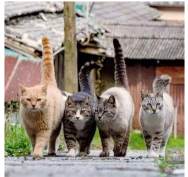
The new Mob

This 1961 photo is called "The Mob", and was shot by professional cat photographer Walter Chandoha. Originally a WW II combat photographer, his signature style was filming cats at their eye level. He collected nearly 100,000 cat photographs and it's pretty cool that someone made a career out of this.